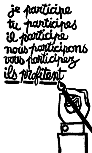
FIGURE 1 French Student Poster. In English, I participate; you participate; he participates; we participate; you participate . . . They profit.

There is a critical difference between going through the empty ritual of participation and having the real power needed to affect the outcome of the process. This difference is brilliantly capsulized in a poster painted last spring by the French students to explain the student-worker rebellion. 2 (See Figure 1.) The poster highlights the fundamental point that participation without redistribution of power is an empty and frustrating process for the powerless. It allows the power-holders to claim that all sides were considered, but makes it possible for only some of those sides to benefit. It maintains the status quo. Essentially, it is what has